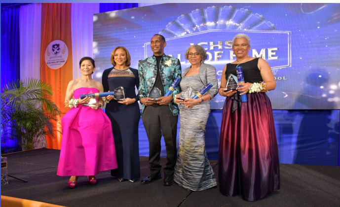
The 2024 Hall of Fame Inductees