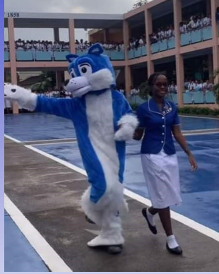
The Girls are great achievers. They make us proud