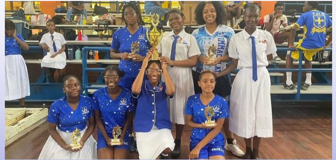
April 17, 2024—Our Table Tennis Team won the under 16 all island final

Did you know that ICHS has a Steel Pan Ensemble?