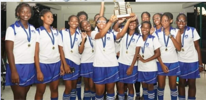
Our Hockey Team winning the under 19 hockey Championship. April 19, 2024 against St. Andrew High School (Score 1-0)