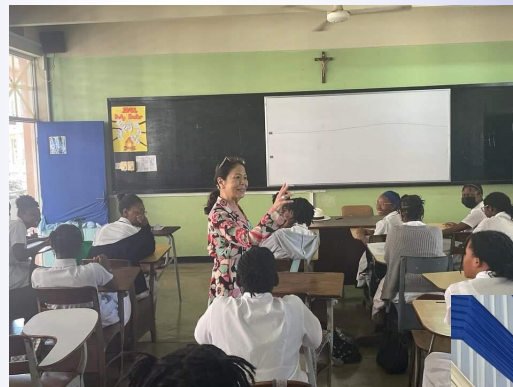
A visit to ICHS in March, 2024 by Members of the Toronto Chapter and other Chapters