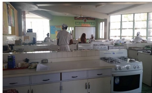
One of the two Food and Nutrition Labs as they look today.....Beautifully clean but in need of updating