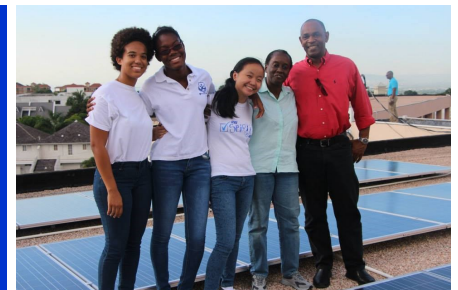
Solar Power now at ICHS