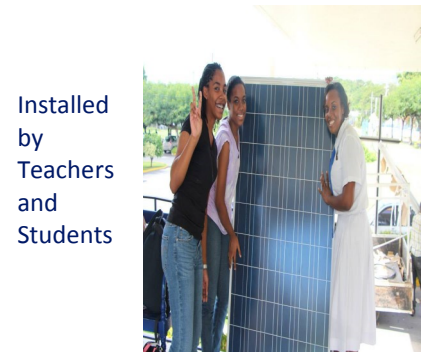
Installed by Teachers and Students