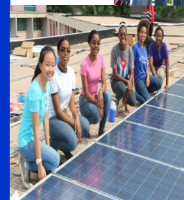
A Proud Moment for All involved.